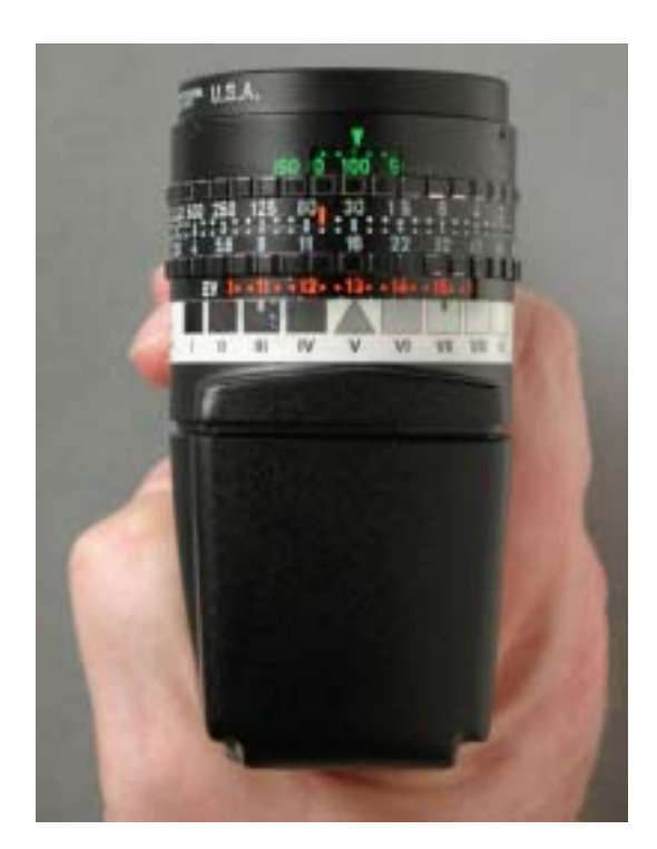
fig.1 The customized zone dial for the Pentax Digital Spotmeter is a visual reference and will simplify zone placement. Zone III and VII are marked to place shadow and highlight details.

The lightmeter became part of the photographer's tool-box about 100 years after the invention of photography. Beforehand, photographers relied on empirical methods or a set of reference tables to determine the correct film exposure. Early exposure meters consisted of a holder for light sensitive paper and comparison step wedges with increasing densities. The paper was exposed for a given time to the same lighting conditions as the scene and then compared to the step wedge. The step, which was the closest to the exposed paper in density, gave an indication of