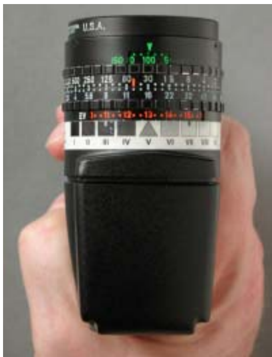
fig.1 The customized zone dial for the Pentax Digital Spotmeter is a visual reference and will simplify zone placement. Zone III and VII are marked to place shadow and highlight details.